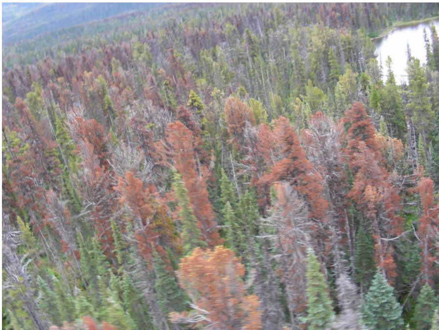
Figure 2. Mortality of mature whitebark pine in west central BC. (a) Coles Lake study area with mortality mostly from late-1980s beetle outbreak and succession to mountain hemloc. (b) Bergeland Lake study area with mortality mostly from the still-active 2000s beetle outbreak. (S. Haeussler photos, taken in 2009 and 2007).