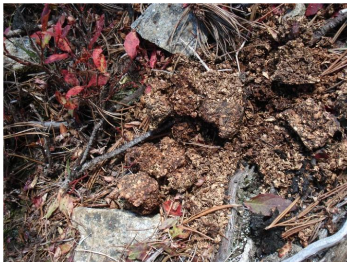
Figure 3. Bear scat composed of whitebark pine seedcoats from Mt. Sidney Williams, north of Fort St. James, BC.

The importance of listing whitebark pine goes well beyond the fate of a single species. Because of whitebark pine' keystone importance in subalpine forest ecosystems, the future health of a complex ecological network may be at stake. The relationships between whitebark pine and other trophic groups (grizzly bears, Clark's nutcrackers, small mammals, salmon, berries) are not well understood in British Columbia. Research is indicating that whitebark pine may provide a critical alternative food source to berry or salmon resources undergoing significant oscillations, perhaps due to climate change (Tony Hamilton, Large Carnivore Specialist, BC Ministry of Environment, personal communication; Figure 3). Listing Pinus albicaulis as endangered could provide the stimulus to improve management efforts for grizzly bear (SARA listed as Special Concern) particularly in Threatened Grizzly Bear Population Units (such as the South Chilcotin) that also support extensive stands of whitebark pine.