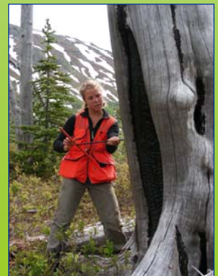
This old whitebark pine experienced several wildfires