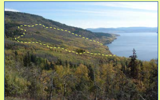
Proposed 2010 burn at Red Hills on Francois Lake