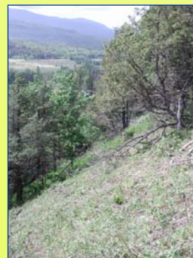
Brush-sawing and aspen girdling (Hubert Hill/Toodienia) effectively recreates the appearance of the Juniper savanna steppe but shrub regrowth is still vigorous after 3 years of cutting.