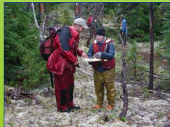
White carpets of reindeer (Cladina) lichens are a distinctive feature of these ecosystems