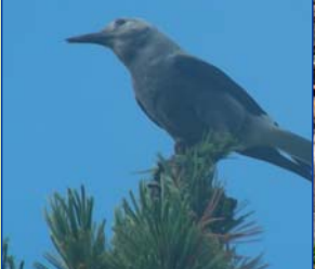
Clark's Nutcracker caching seeds (note swollen throat pouch)

In 2007, the Bulkley Valley Research Centre undertook a research project to investigate how Whitebark pine – Cladina lichen ecosystems are responding to cumulative stress from: