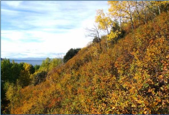
Endangered SBSdk/81 grasslands (scrub-steppe) in Uncha Mtn - Red Hills Provincial Park, at risk from woody plant invasion.