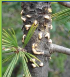
White pine blister rust damage in young whitebark pine trees.