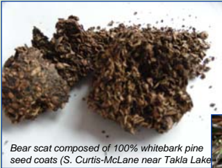
Bear scat composed of 100% whitebark pine seed coats (S. Curtis-McLane near Takla Lake)

because the highly nutritious whitebark pine seeds support a complex subalpine foodweb.