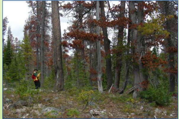
Endangered ESSFmk/02 Whitebark pine - lichen woodlands in Nanika - Kidprice Provincial Park, at risk from mountain pine beetle & white pine blister rust.

Although SBS grasslands and ESSF lichen woodlands are very different, these two endangered ecosystems share many common features: