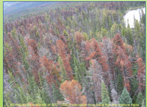
Whitebark pine stands at 800-1000 m elevation now have few live mature trees