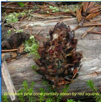
Whitebark pine cone partially eaten by red squirrel