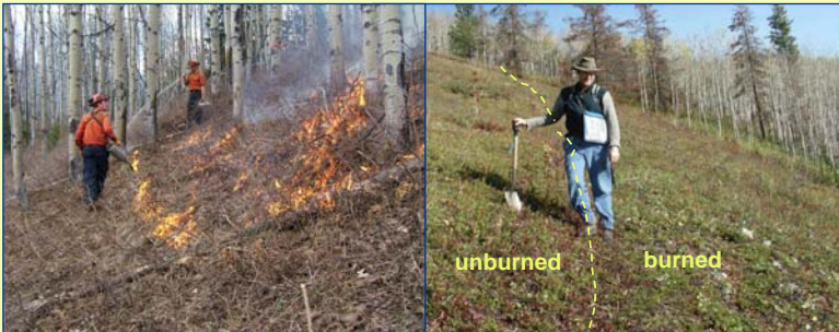
Nadina Fire Centre unit crews blacklining and wetting the burn perimeter. Red Hills prescribed burn, May 2008.