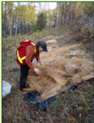
Mulching for yellow hawkweed control (Det San Ecological Reserve) may create dead zones that are difficult to revegetate.